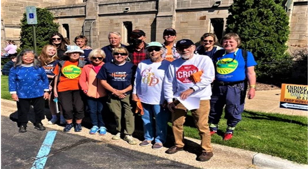
FPC-Muskegon Team for CROP Hunger Walk ready to start 2.5-mile on October 2, 2022: