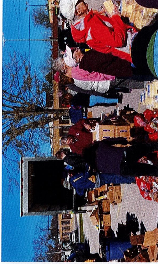
Emptying food pallets; boxes for re-using or recycling