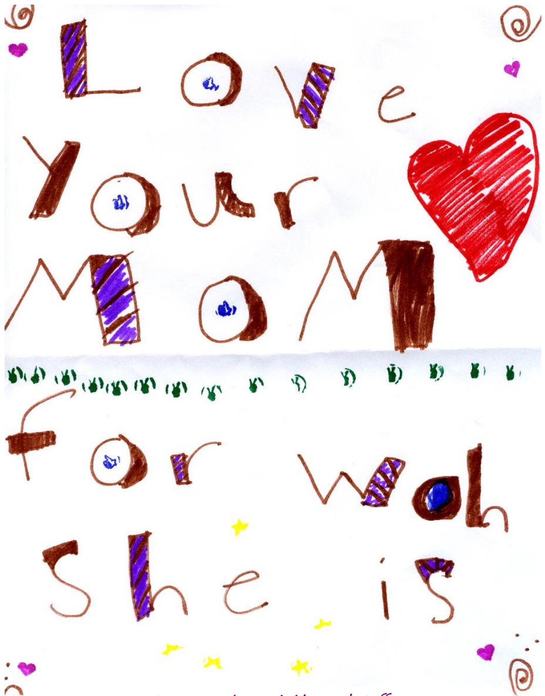
Cover artwork provided by Uriah Coffee